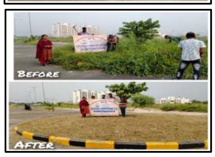
Glimpses of Before and After for cleanliness drive (horticulture section)