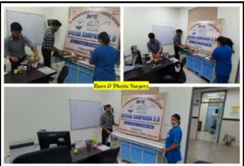
Glimpses of Before and After for Cleanliness activities (Shramdaan) by Various department