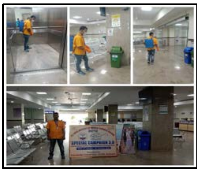
Glimpses of Before and After for cleanliness drive (housekeeping section)